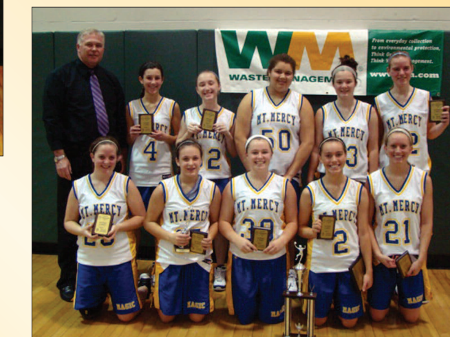
Mt. Mercy of Buffalo won the junior varsity championship at the annual tournament, held November 27 and 28 at Pioneer. Mt. Mercy defeated Immaculata Academy in the opener and St. Mary's of Lancaster in the final game.