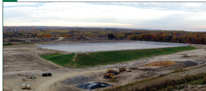
Cell IV liner construction in progress earlier this year

We recently completed construction of our new landfill cell IV. This 10-acre cell includes the same design features and environmental protections as our other recent cells, and will begin seeing regular use early next year. Cell IV is located in the interior of our property, so you may not have noticed our liner construction unless you visited or attended our Open House & Information Fair in August, where we conducted tours of the work in progress.