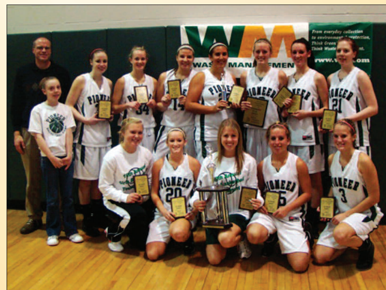
Pioneer's varsity was this year's tournament champion, defeating St. Mary's of Lancaster in the opening round and Immaculata Academy in the championship game.